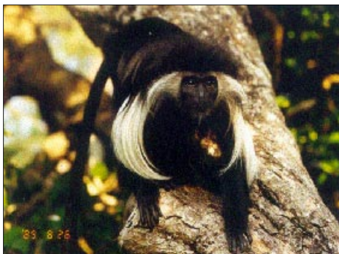
Black and white colobus monkey ( Colobus angolensis palliatus )

Shimba Hills National Reserve encompasses an area of 241 km 2 of which 95 km 2 comprise of coastal forest and the rest is open grassland vegetation (Bennun and Njoroge, 1999). The nearby Maluganji Sanctuary is 17 km 2 .