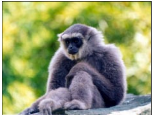
Javan Gibbon ( Hylobates moloch)