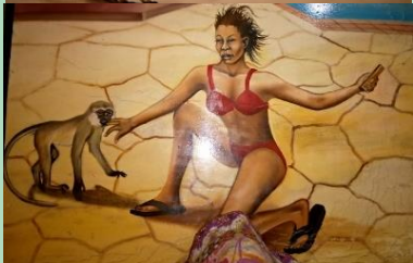
Pic1: Most dominant monkey feeds first.