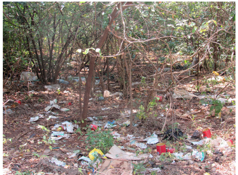
Top Right & Middle: Diani Residents Bottom Right: Area in Diani